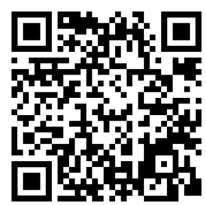
View on our Website